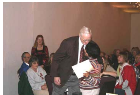
Artist recognition 2007 "Art 4